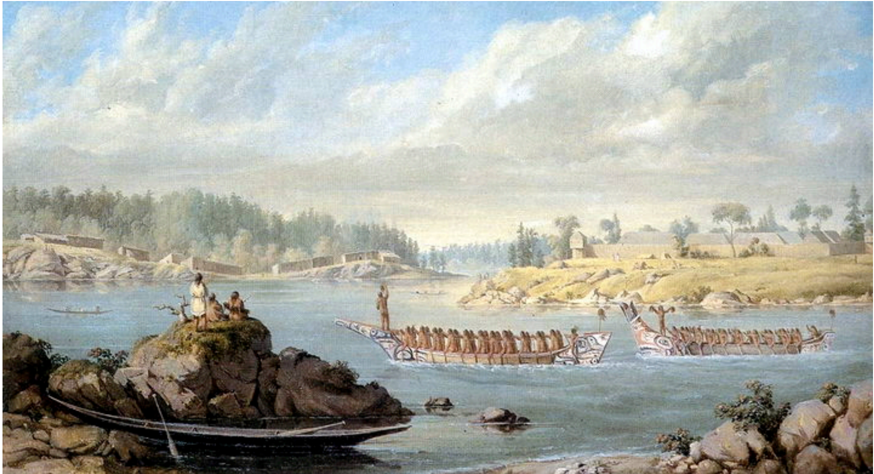
"Return of a War Party." Artist: Paul Kane (1847) Songhees Village and Fort Victoria (Royal Ontario Museum, ROM2005_5161_1)