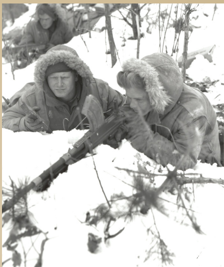
Canadian soldiers in snowy Korea in 1951.

"[...] We took an attack at night [...] one wave and another wave behind and another wave behind, like, it seemed like they had endless, endless, endless men. [...] And it was pretty damn scary when the flares were going up and you could see all these, it looked like a bunch of ants crawling around, coming up the hills [...] it was scary, but you knew you had a job to do and you had to do it, you know."