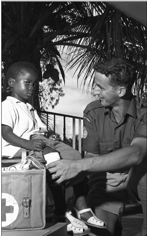
Canadian soldier bandages a child's leg in the Congo in 1963.

Despite some successes, in the end the UN troops were unable to stop the greater forces of upheaval rocking the Congo and they departed in 1964. Two Canadian soldiers died during the mission.