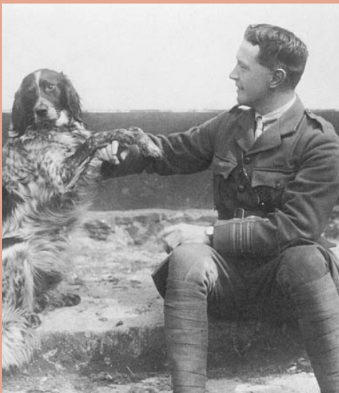
Lieutenant-Colonel John McCrae and his dog Bonneau.

To you from failing hands we throw The torch, be yours to hold it high.