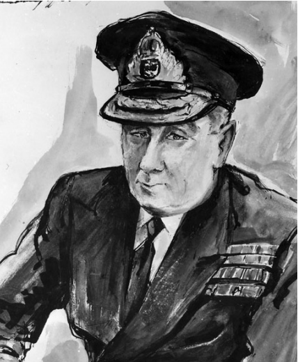
Portrait of Rear Admiral Victor Brodeur in 1945 by Irwin Crosthwait.