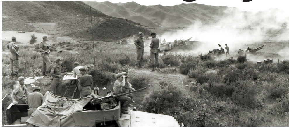
The 2 nd Regiment, Royal Canadian Horse Artillery in action in Korea.

Photo: Library and Archives Canada PA-128280