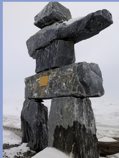
Inuksuk near CFS Alert in Nunavut.

When ships run into problems at sea or aircraft go down in remote areas, Canadian Armed Forces members are often first on the scene to aid those in distress. These missions can be very dangerous and challenging, like when a Hercules military transport plane went down near CFS Alert in the High Arctic in October 1991. In a raging blizzard, search and rescue technicians were sent to parachute down to the crash site at night. Sadly, five on the downed plane had died but the rescuers helped save the lives of 13 survivors.