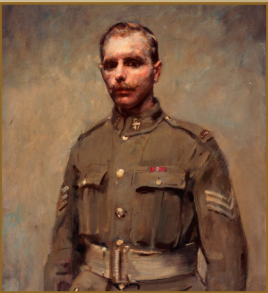
Portrait of Filip Konowal by Arthur Ambrose McEvoy.

Filip Konowal was born in the Ukraine in 1888 and immigrated to Canada shortly before the First World War. When the conflict erupted, he enlisted in the Canadian Expeditionary Force and served with the 47 th (British Columbia) Battalion. During the Battle of Hill 70 near Lens, France in August 1917, Corporal Konowal was leading soldiers in attacks when he courageously charged German machine gun positions that were taking a heavy toll on his men.