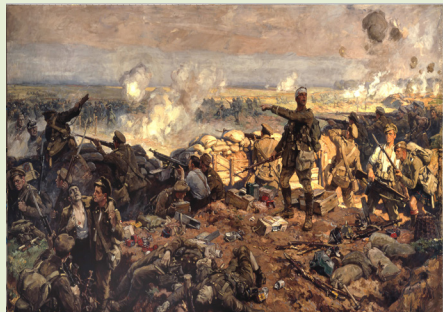
‘The Second Battle of Ypres, 22 April to 25 May 1915’ painting by Richard Jack.

January 1916. Approximately 40 Newfoundlanders had died there, a grim taste of the great casualties the regiment would soon suffer on the Western Front.